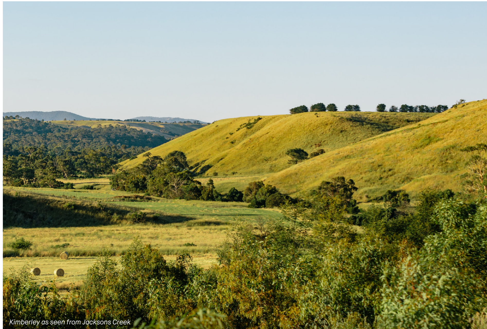
Kimberley as seen from Jacksons Creek

Spanning a stunning escarpment, here will be a community that overlooks countryside, the township of Sunbury and, the majestic Mount Macedon ranges. A sight that shows you don't have to move far to immerse yourself in nature. You don't have to stay in the city to live only minutes from every convenience. In fact, you can now have it all and more.