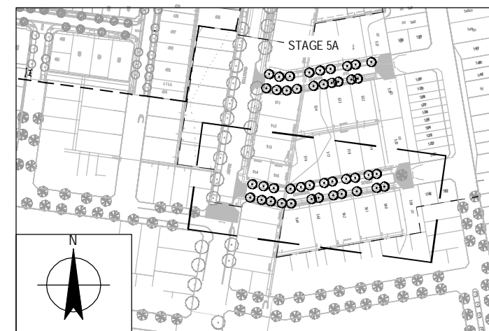
LOCATION PLAN SCALE 1:2000