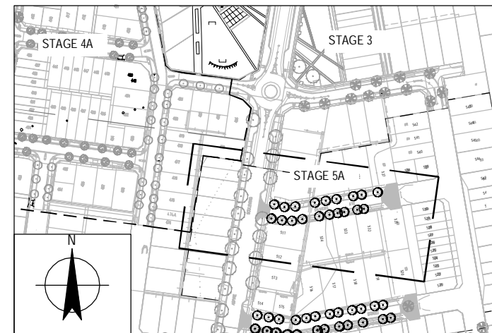
LOCATION PLAN SCALE 1:2000