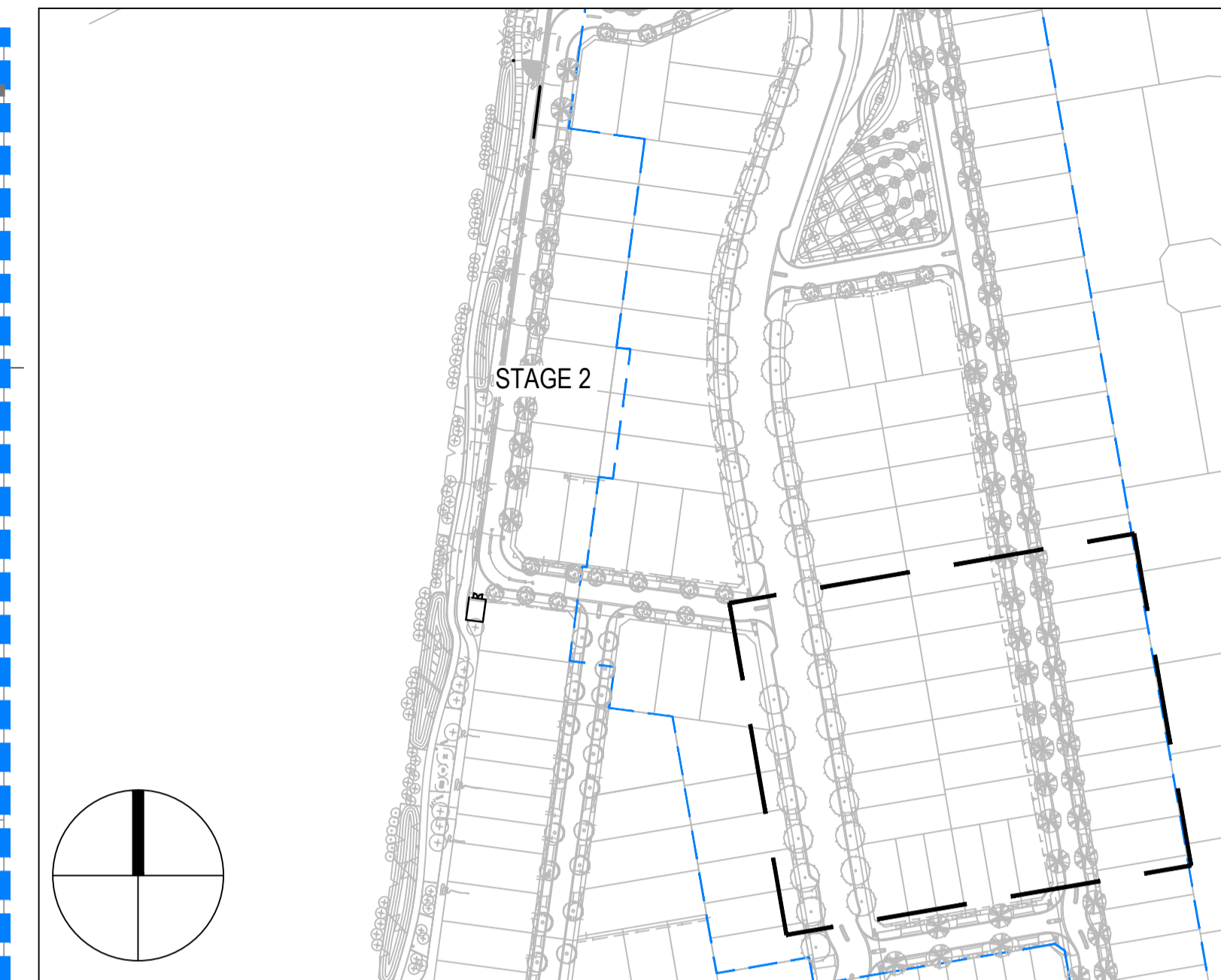
LOCATION PLAN SCALE 1:2000