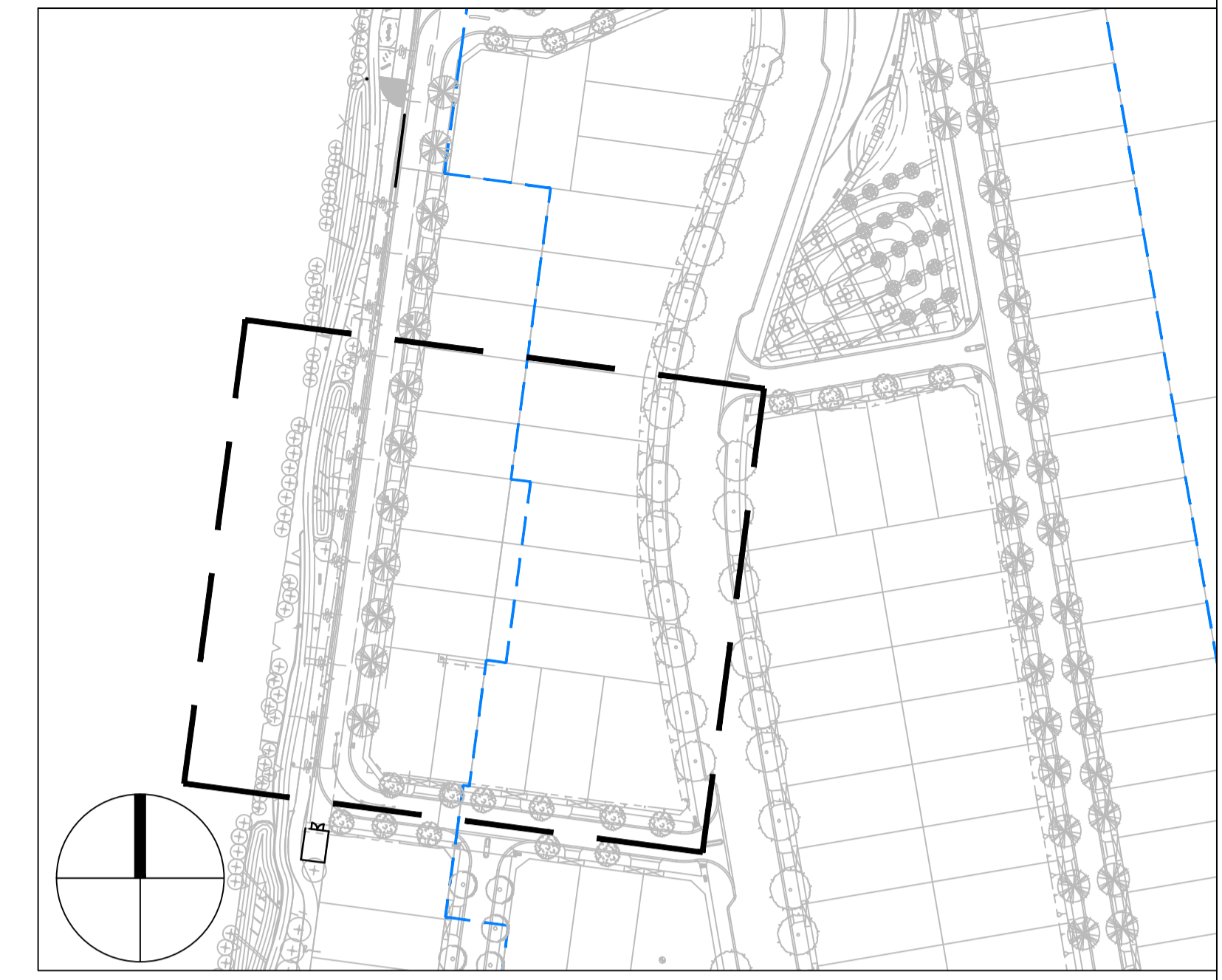
LOCATION PLAN SCALE 1:2000