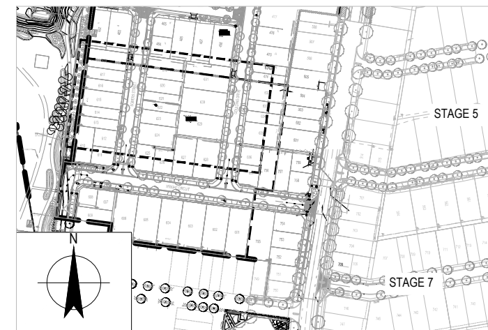
LOCATION PLAN SCALE 1:2000