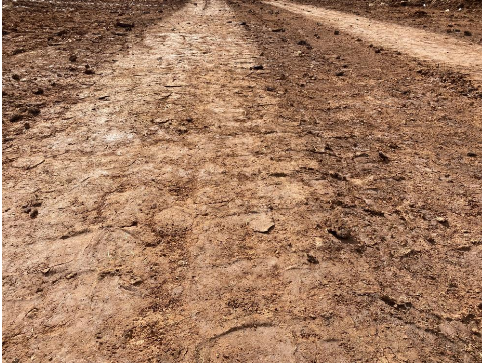
Site Photo 1: Showing the stripped ground surface