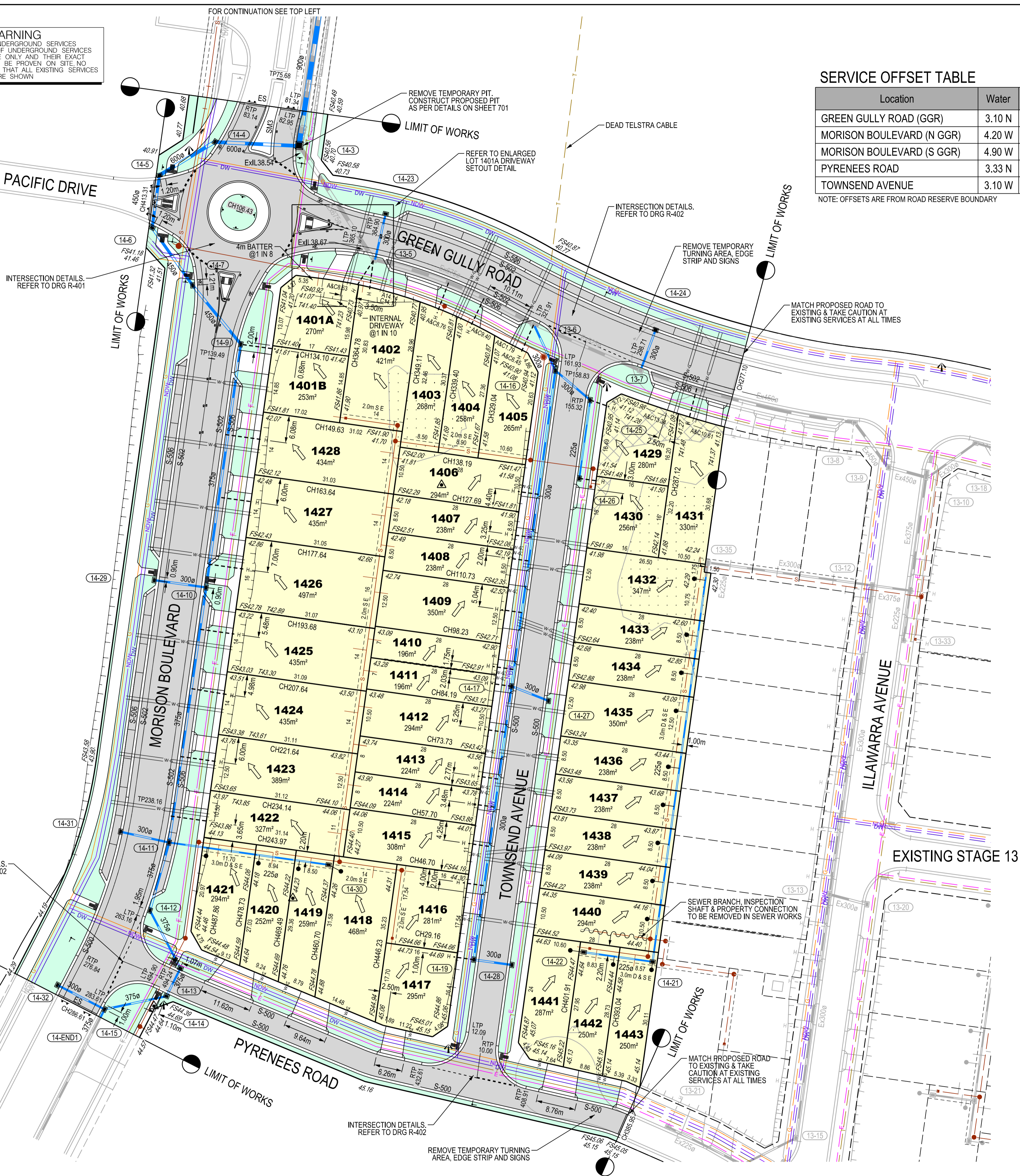
SERVICE OFFSET TABLE

REMOVE TEMPORARY TURNING AREA, EDGE STRIP AND SIGNS