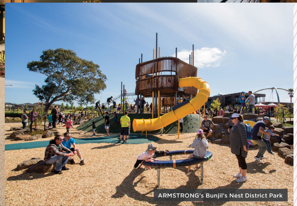
ARMSTRONG's Bunjil's Nest District Park