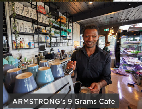
ARMSTRONG's 9 Grams Cafe

The central community hub at ARMSTRONG supports a healthy, active and social lifestyle for both adults and children of all ages - all year round.