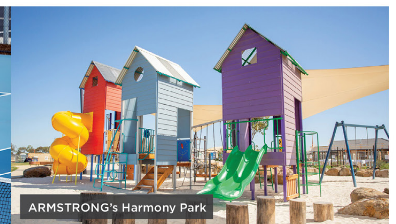
ARMSTRONG's Harmony Park