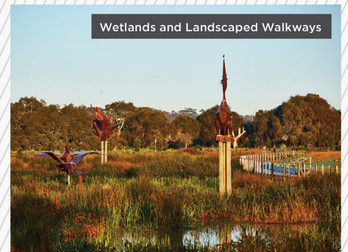
Wetlands and Landscaped Walkways

The central community hub at ARMSTRONG supports a healthy, active and social lifestyle for both adults and children of all ages - all year round.