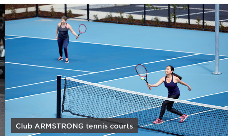
Club ARMSTRONG tennis courts