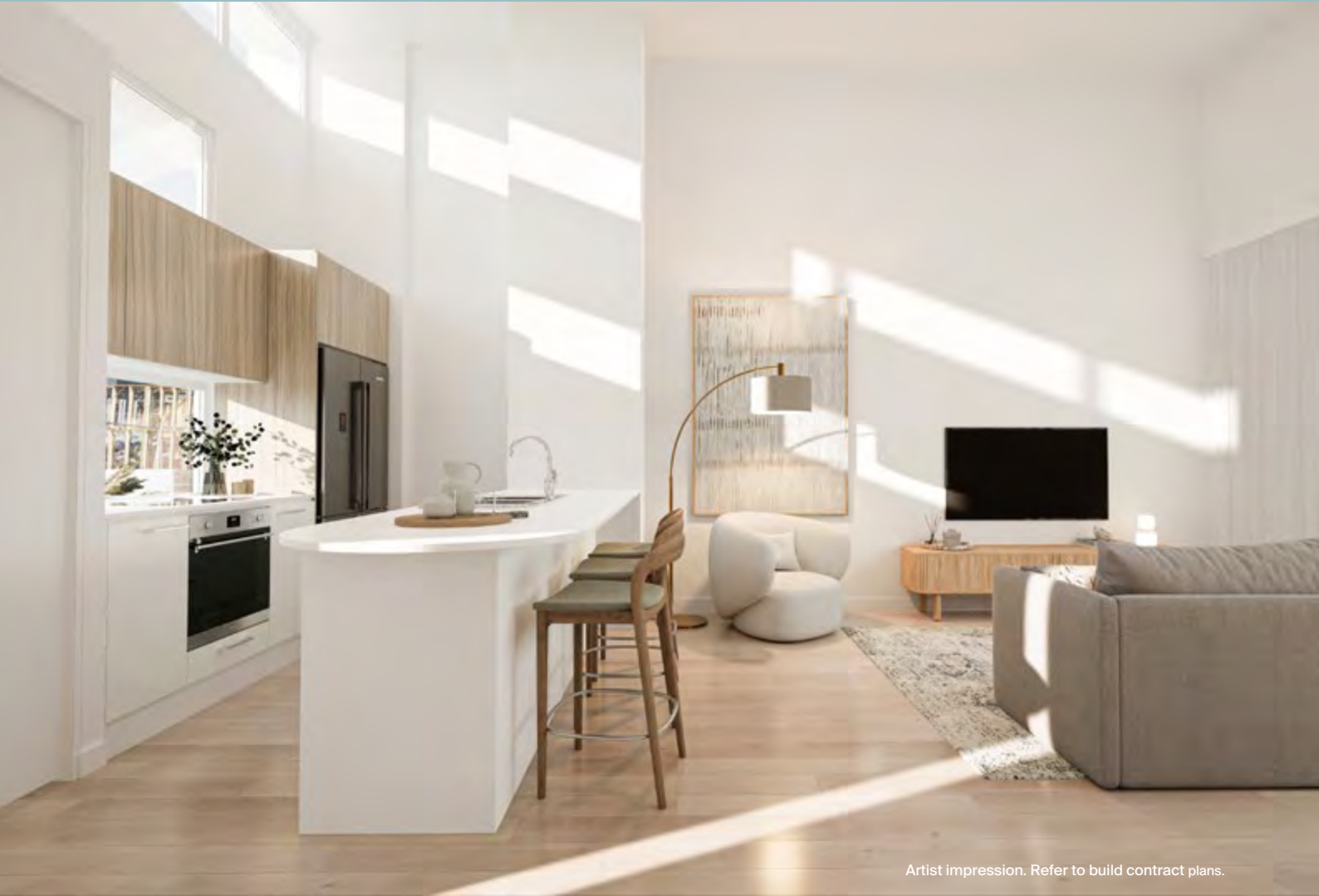
Artist impression. Refer to build contract plans.