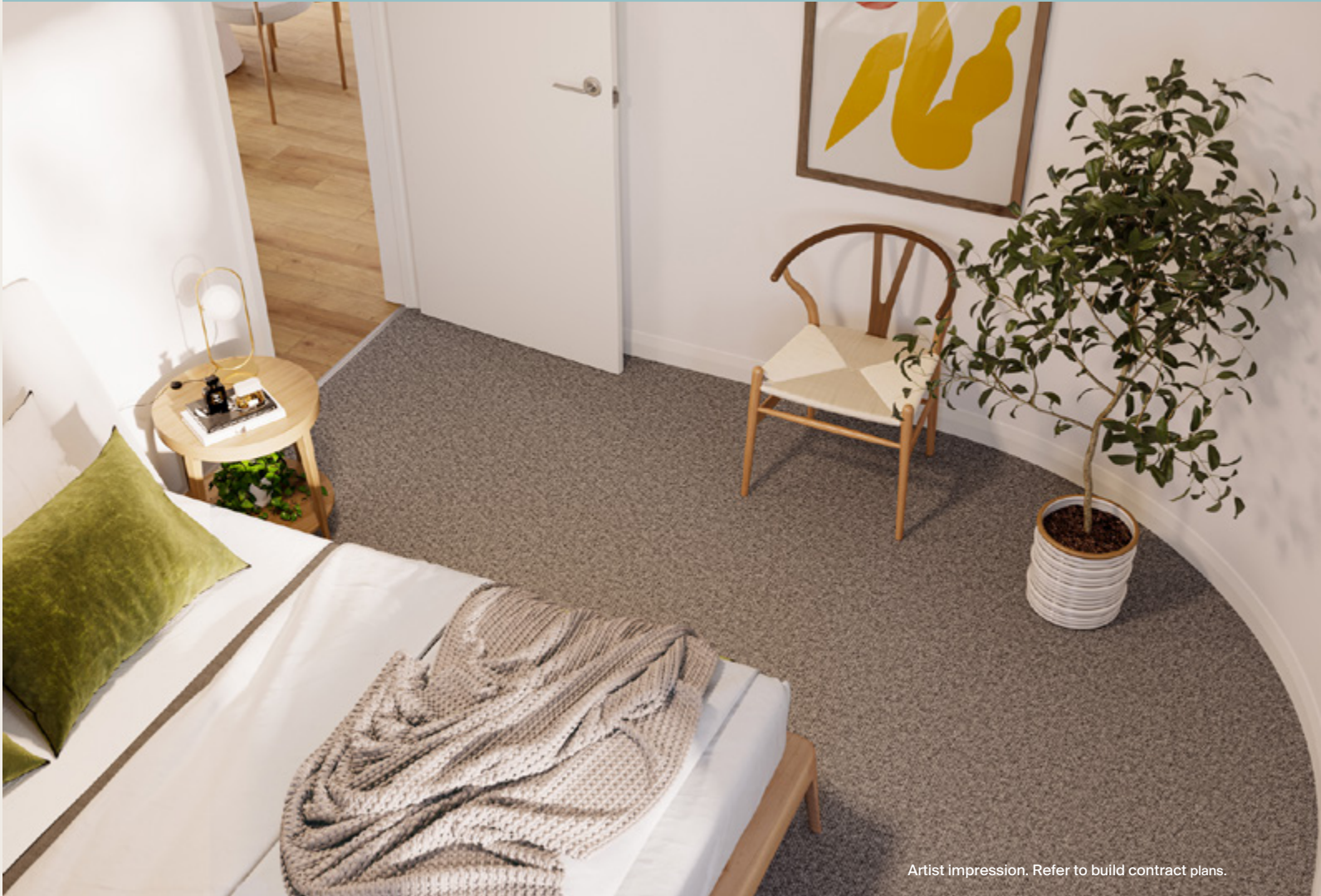
Artist impression. Refer to build contract plans.