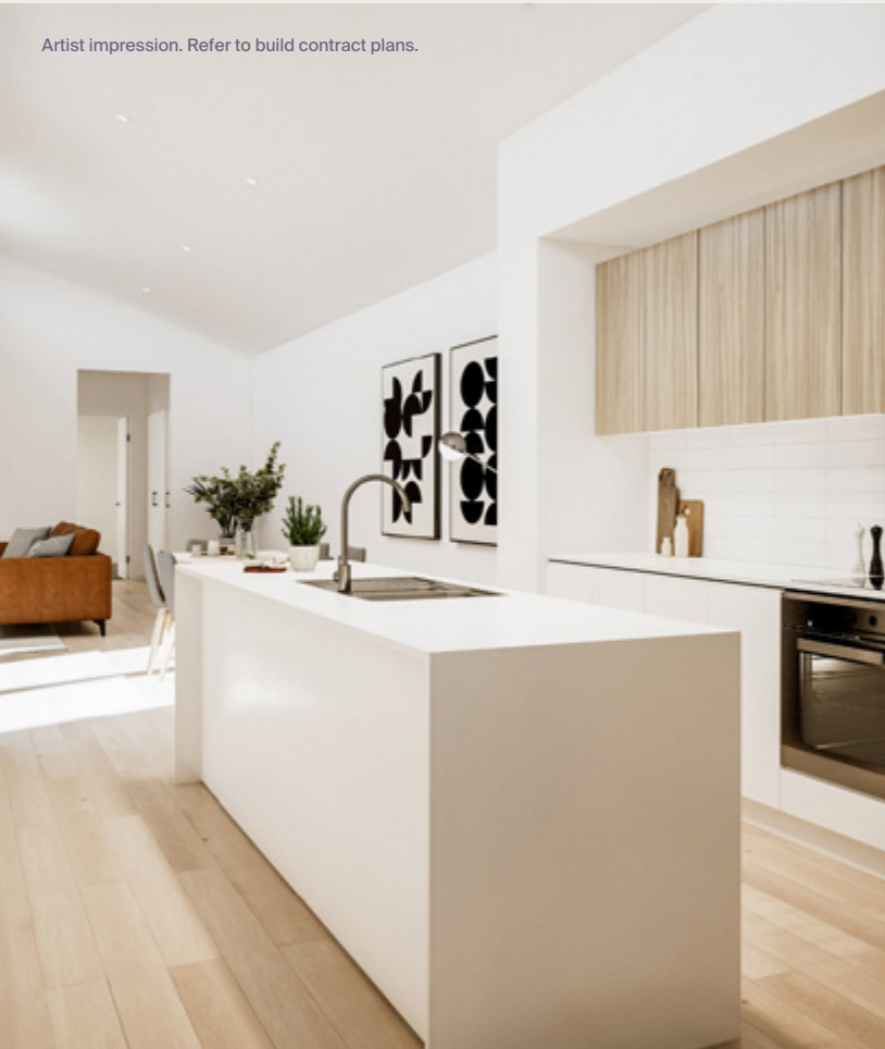
Artist impression. Refer to build contract plans.