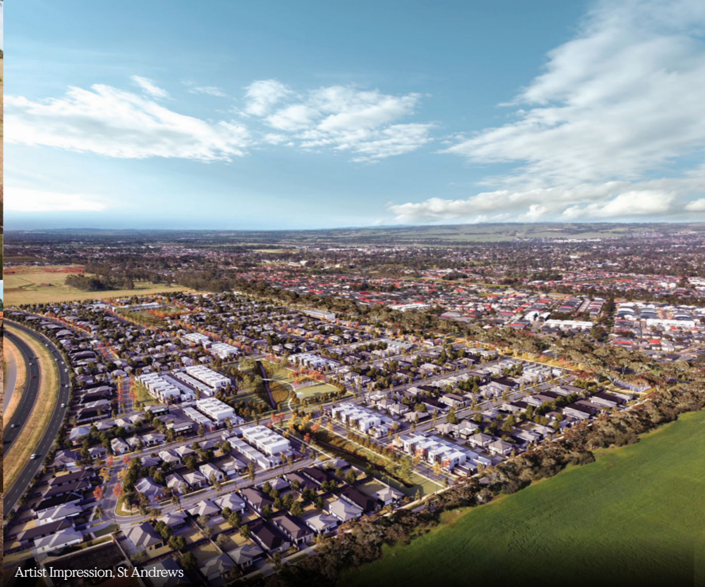
Artist Impression, St Andrews