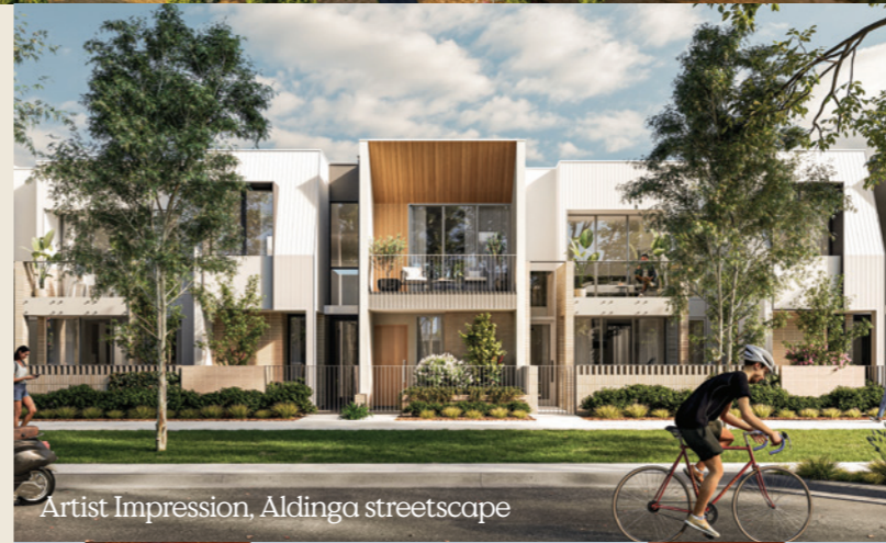
Artist Impression, Aldinga streetscape

Aldinga is the sixth major project by Villawood since its arrival in South Australia in 2021. This is the first time the elements of cost, design, sustainability, social connection and quality have come together like this - all in a beautiful location between the coast and the McLaren Vale vines of Adelaide's outer south.