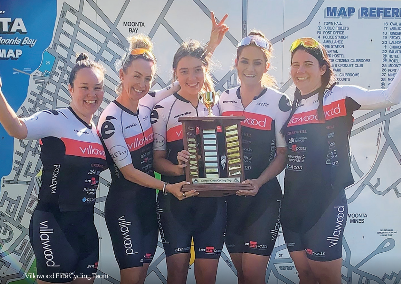
Villawood Elite Cycling Team