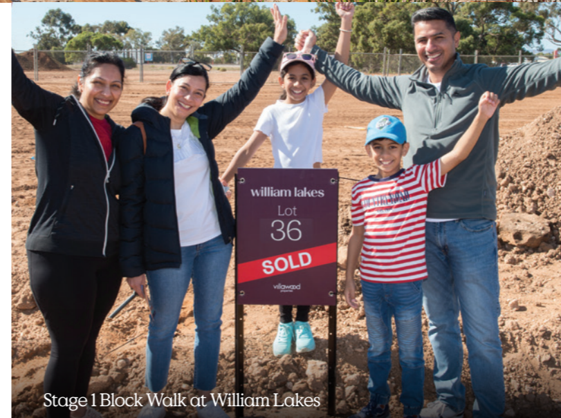
Stage 1 Block Walk at William Lakes

William Lakes is the first development of its kind in South Australia and a beautiful escape from the stresses of everyday life.