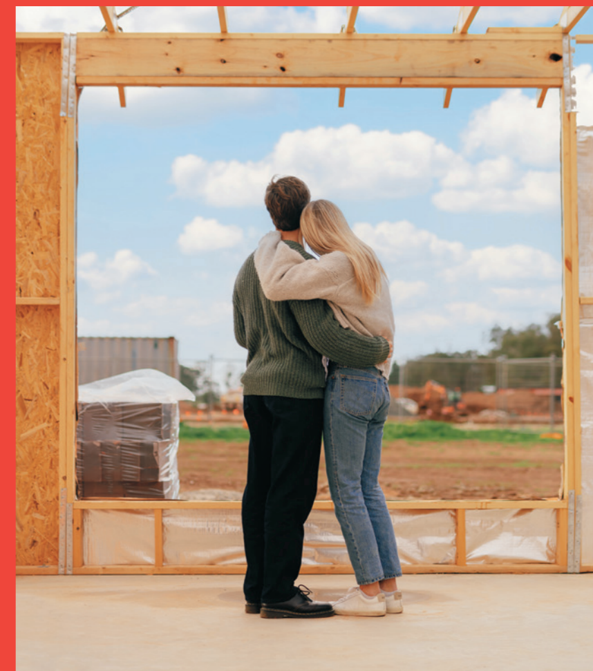
First residents call St Andrews home, Summer 2024!