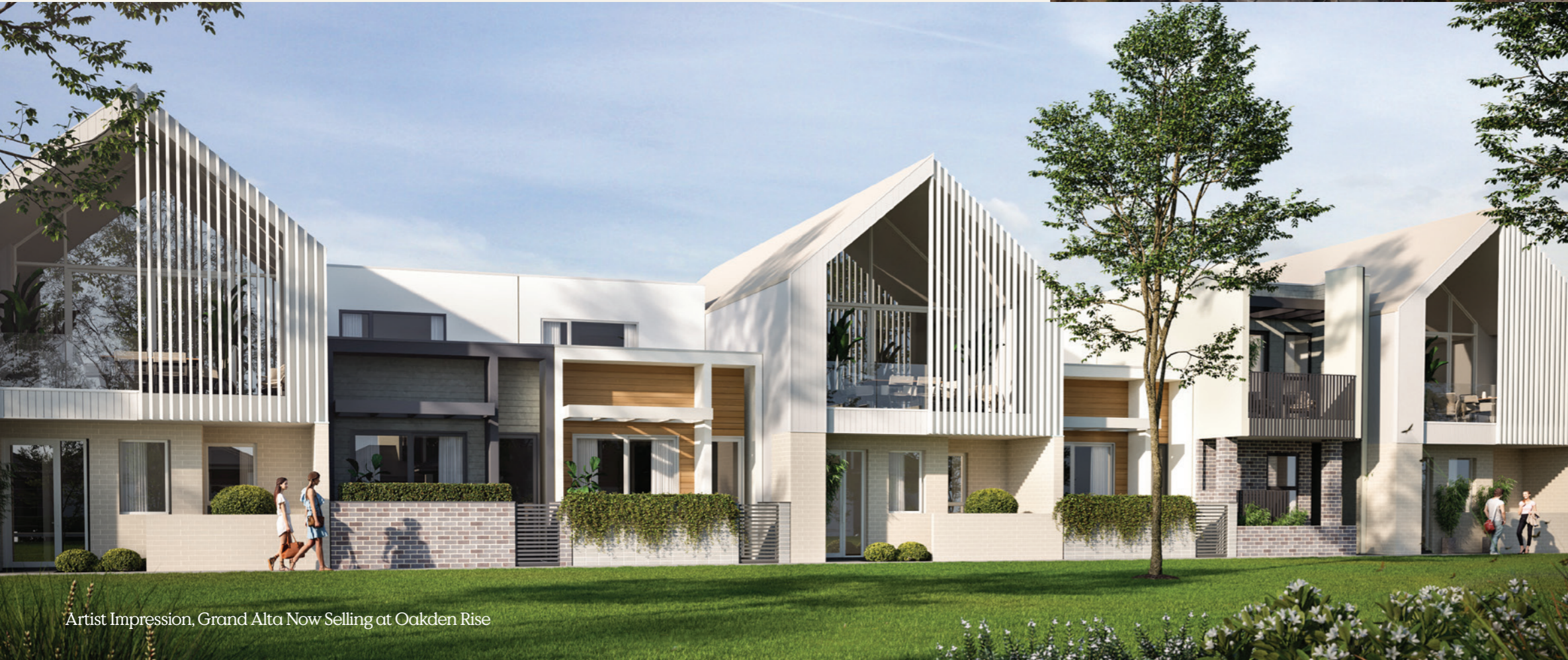
Artist Impression, Grand Alta Now Selling at Oakden Rise