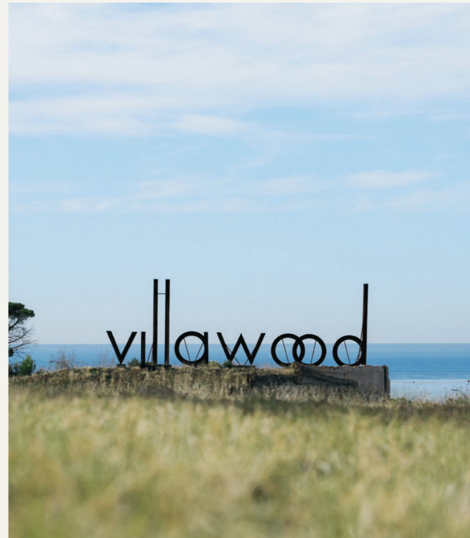
Villawood signs are popping up all over Adelaide. Pictured is signage at Seacliff Village.

From William Lakes in Adelaide's north to Seacliff Village on the southwest coast, more and more South Australians are choosing to live in Villawood communities. So what's it all about?