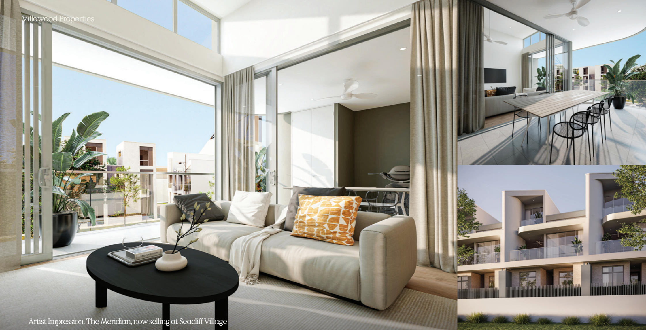
Artist Impression, The Meridian, now selling at Seacliff Village