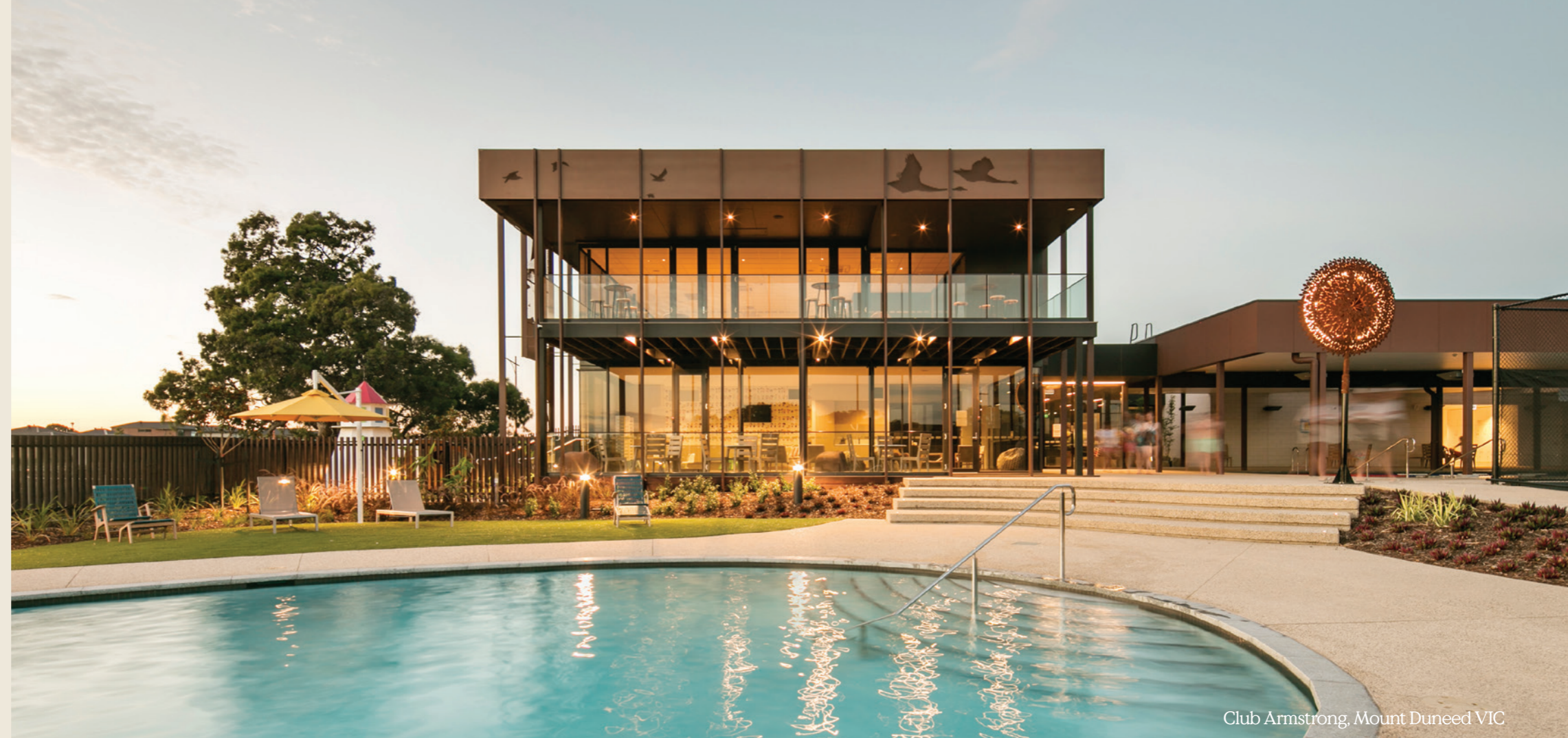
Club Armstrong, Mount Duneed VIC

“There's only one place you'll find us when the sun is shining and that's swimming in the year-round heated pool!