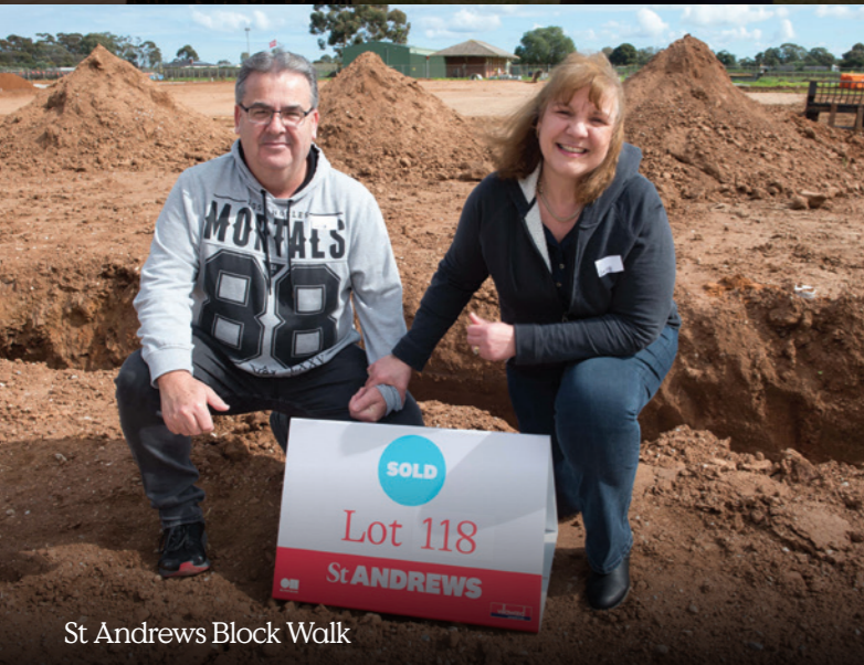
St Andrews Block Walk