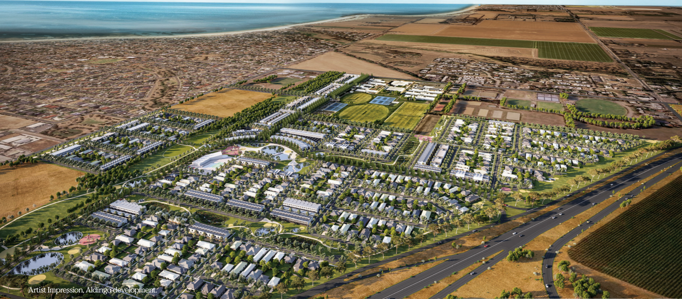
Artist Impression, Aldinga development.