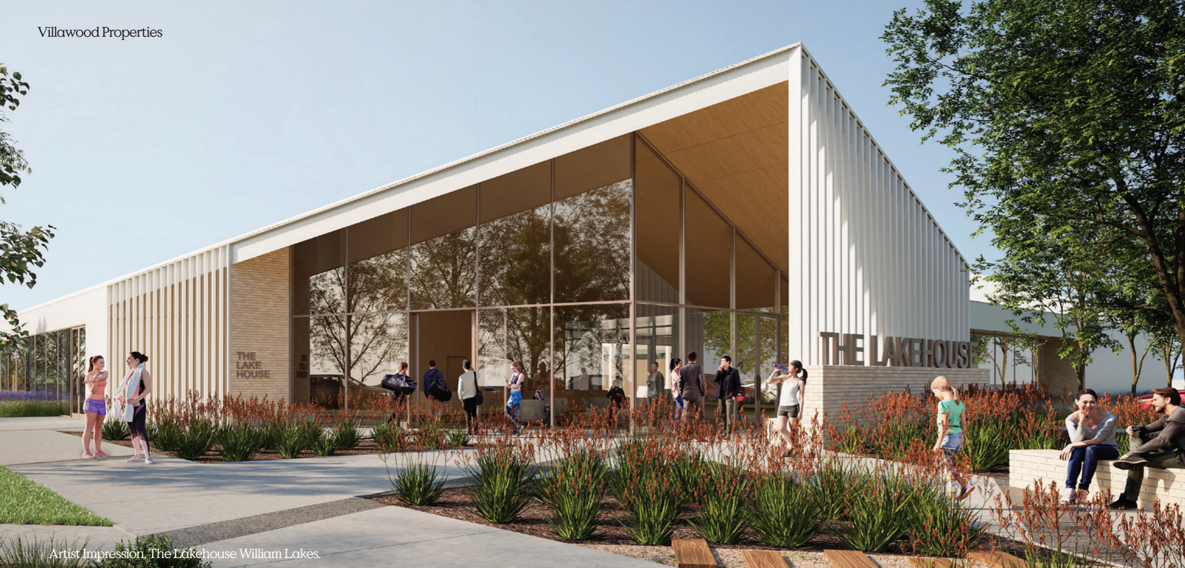
Artist Impression, The Lakehouse William Lakes.