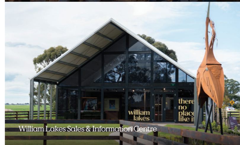
William Lakes Sales & Information Centre

Explore house & land packages now selling at William Lakes