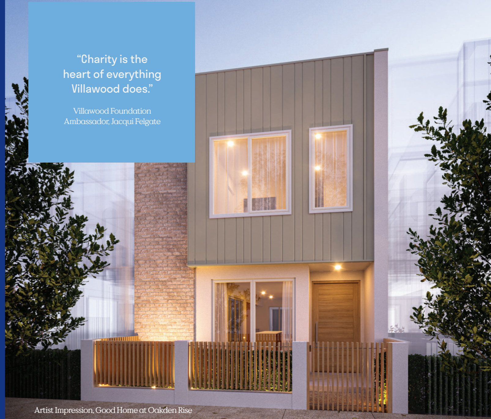
Artist Impression, Good Home at Oakden Rise