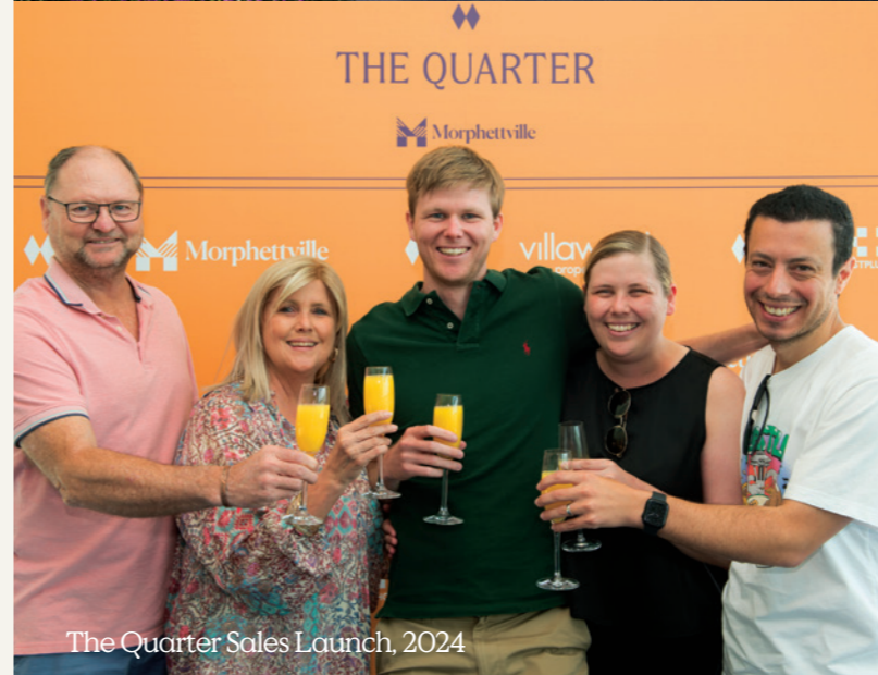
The Quarter Sales Launch, 2024