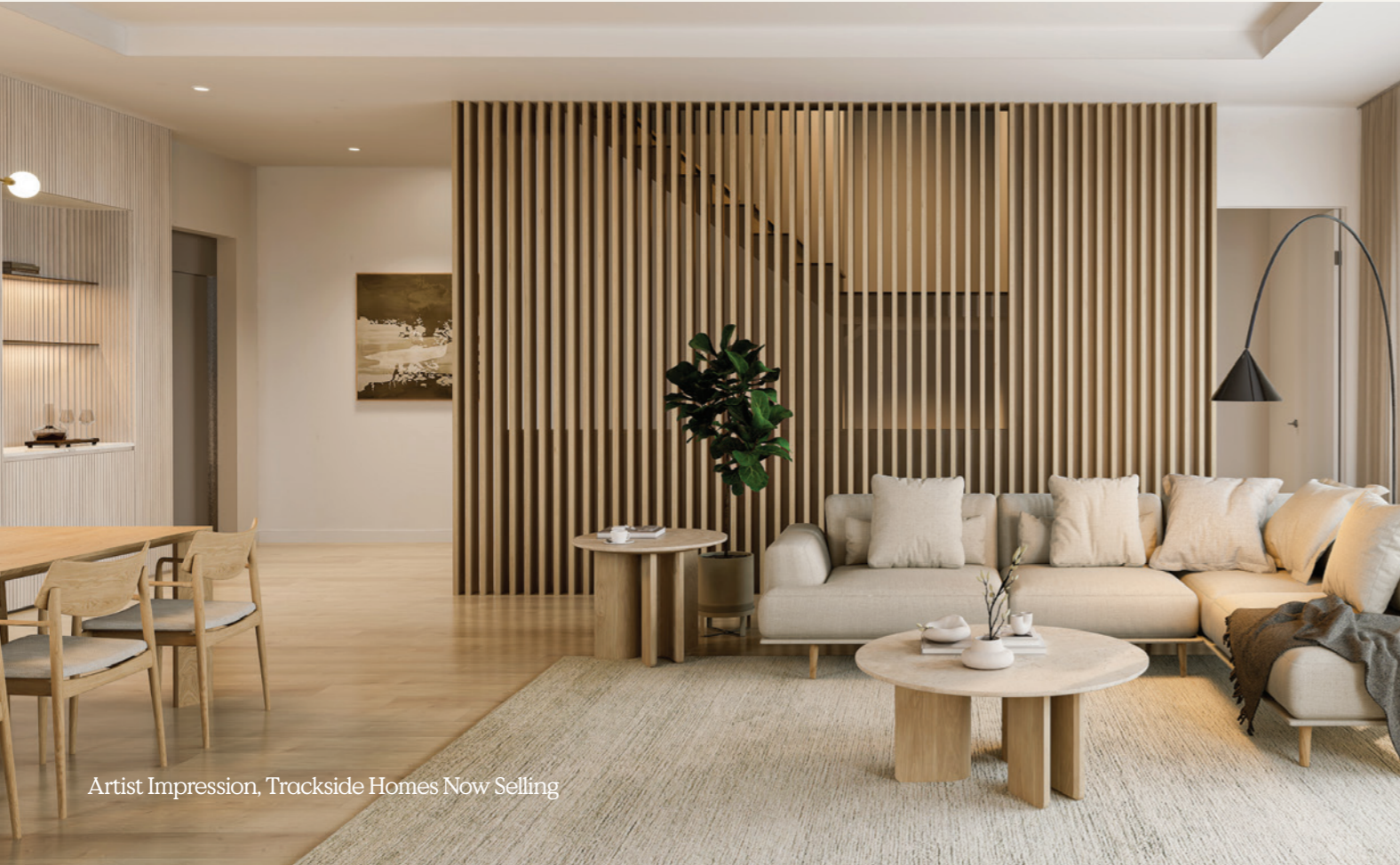
Artist Impression, Trackside Homes Now Selling