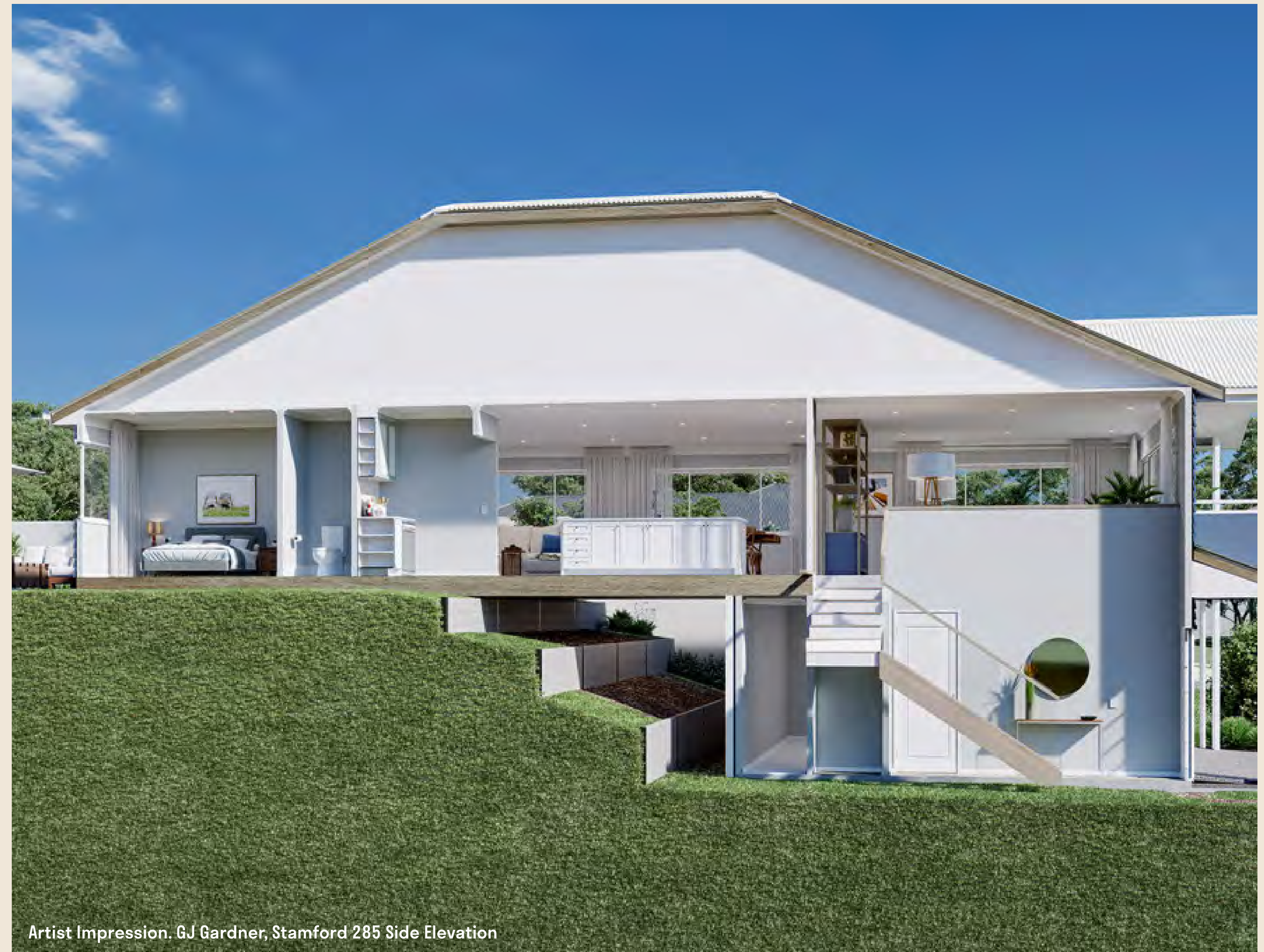
Artist Impression. GJ Gardner, Stamford 285 Side Elevation

Villawood will provide Elevated Builder Partners access to customer databases and marketing support.