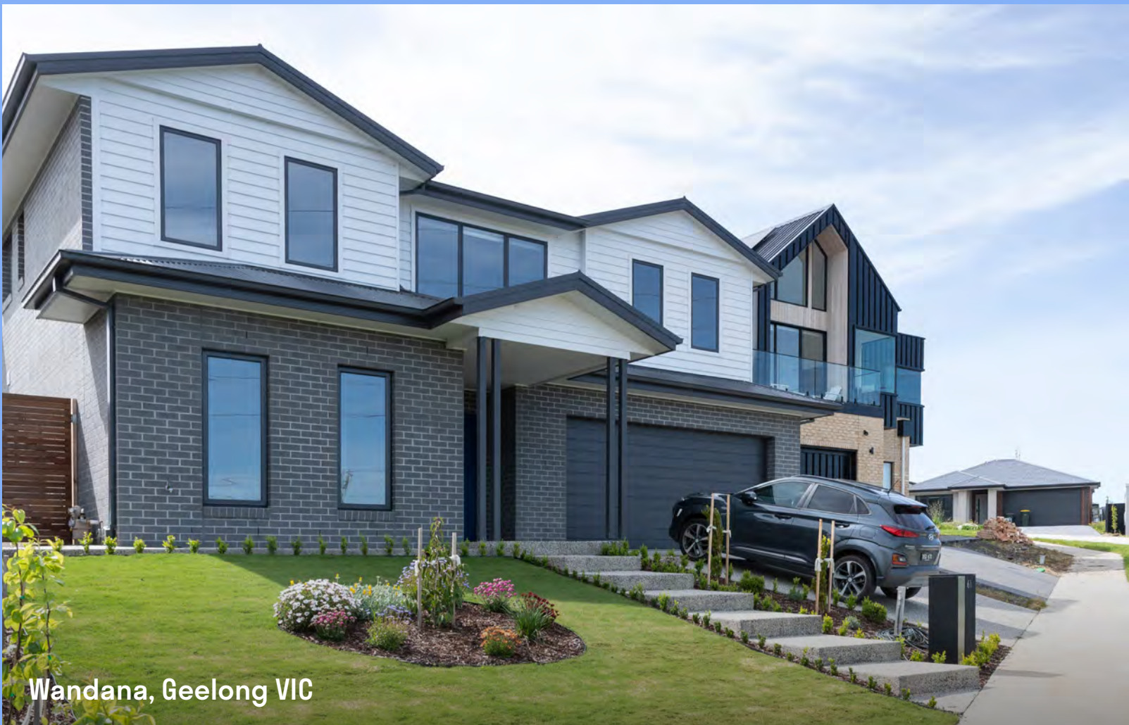
Wandana, Geelong | Winner of UDIA Residential Developments Under 250 Lots Excellence Award, 2022

View sloping streetscapes featured at Villawood's Wandana community in Geelong: Click Here to Preview