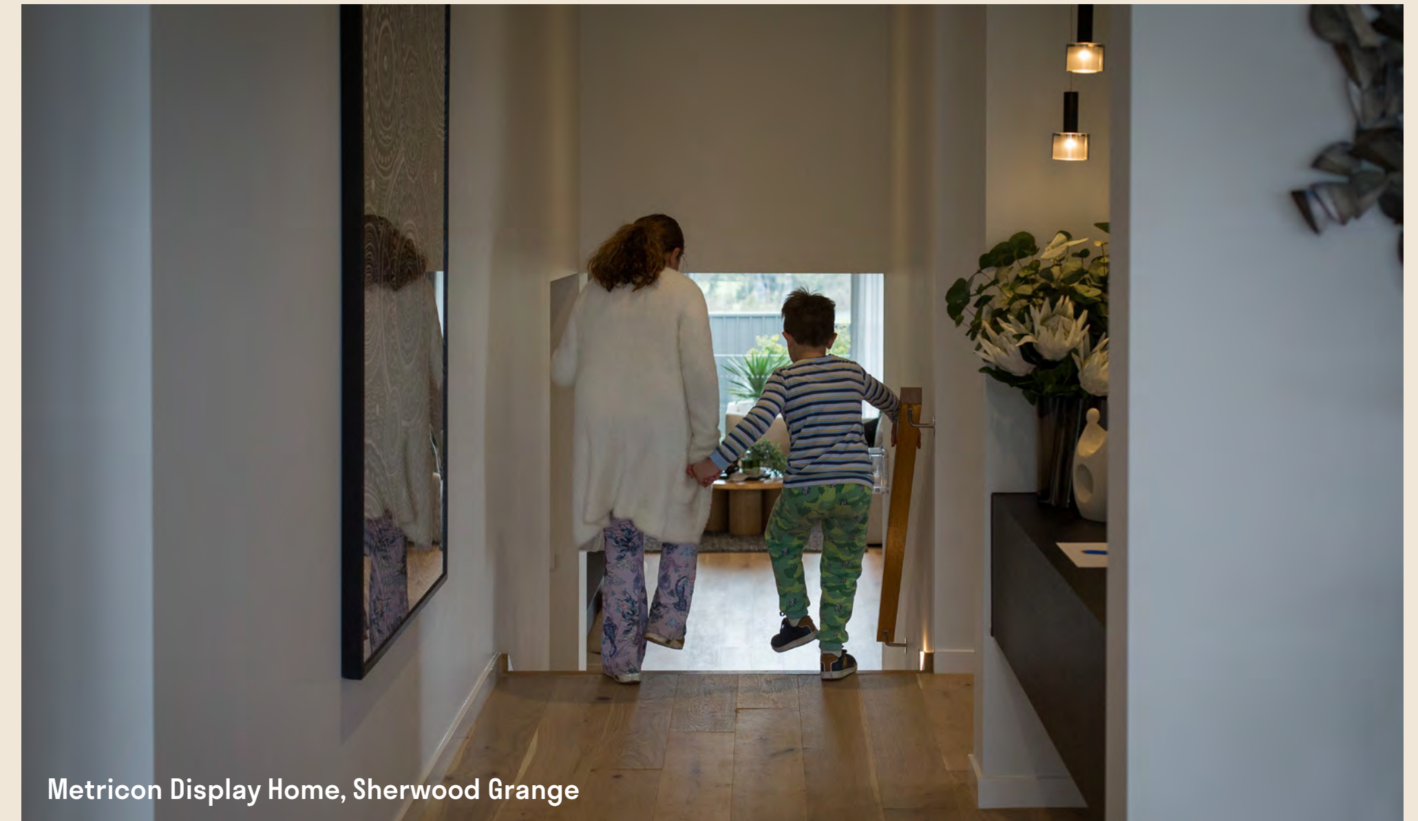
Metricon Display Home, Sherwood Grange