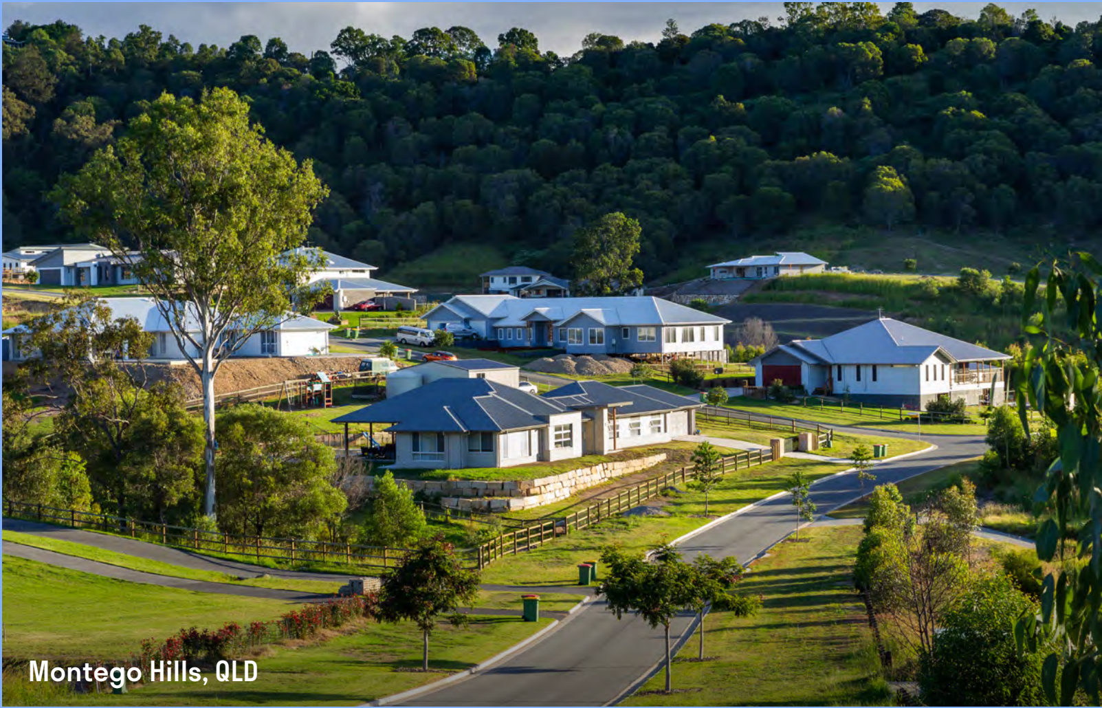
Montego Hills, Gold Coast | Winner of UDIA Best Residential Subdivision in Australia Award, 2021