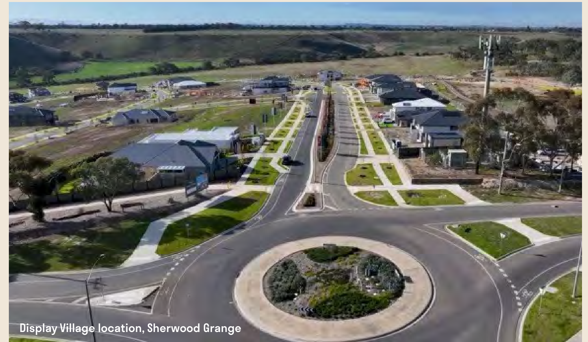
Display Village location, Sherwood Grange

Sherwood Grange attracts subsequent home buyers driven by design and lifestyle. Their budgets are in the vicinity of $1.2 - $1.6m on a house and land package.