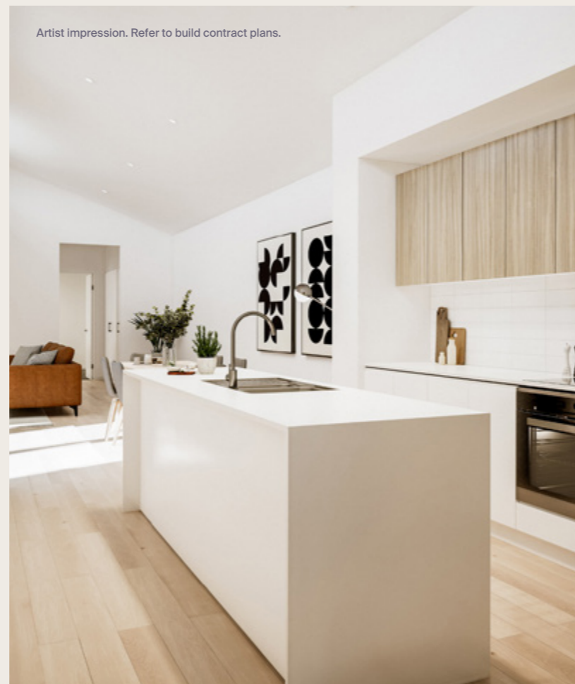
Artist impression. Refer to build contract plans.