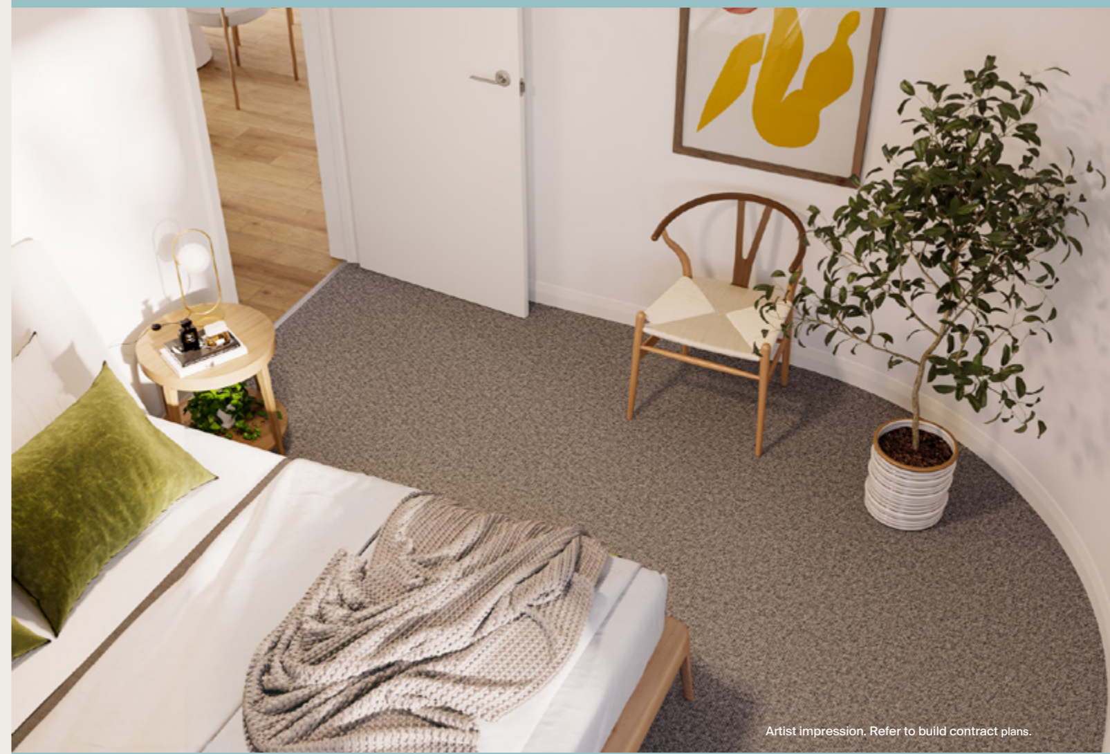
Artist impression. Refer to build contract plans.