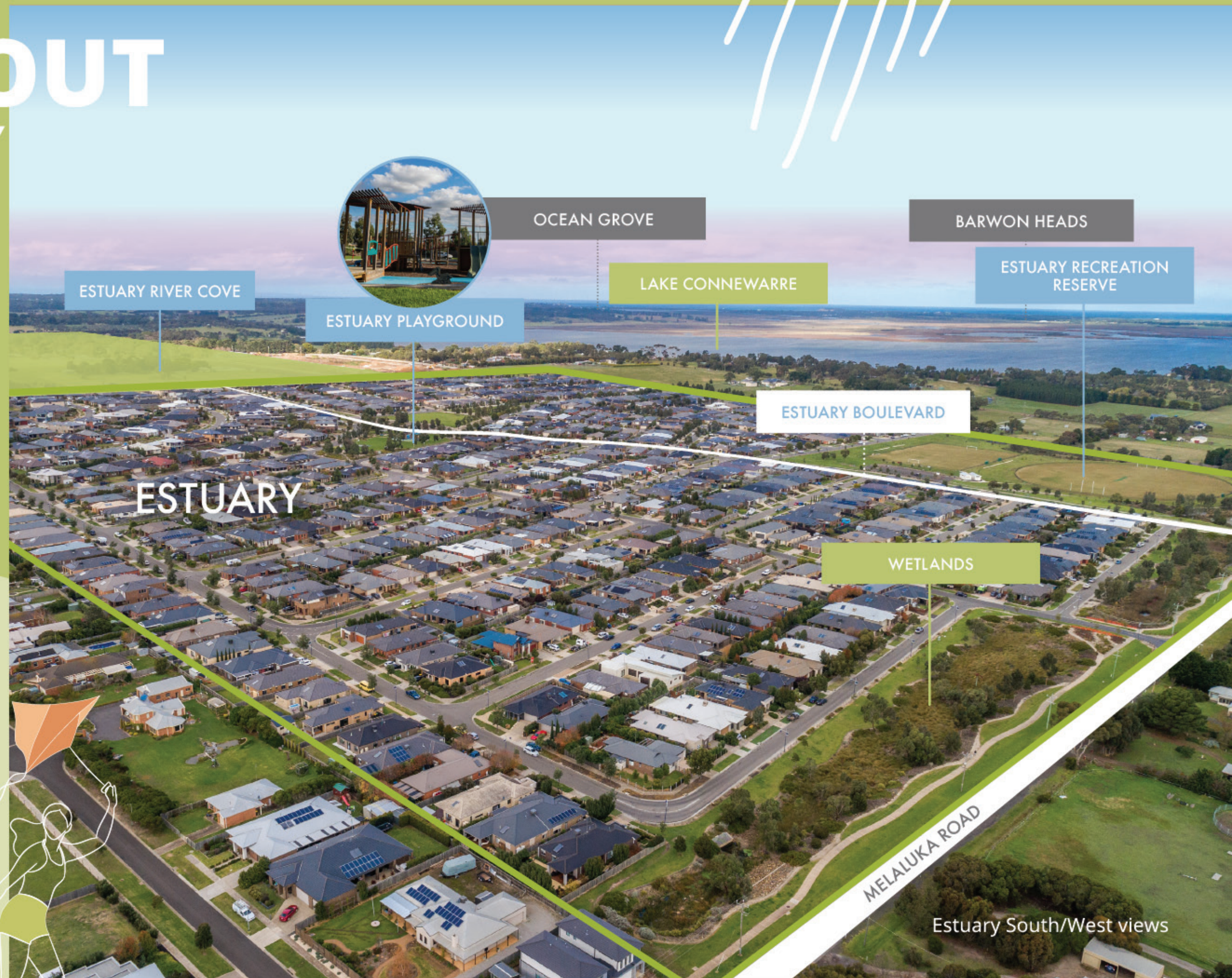
Estuary South/West views