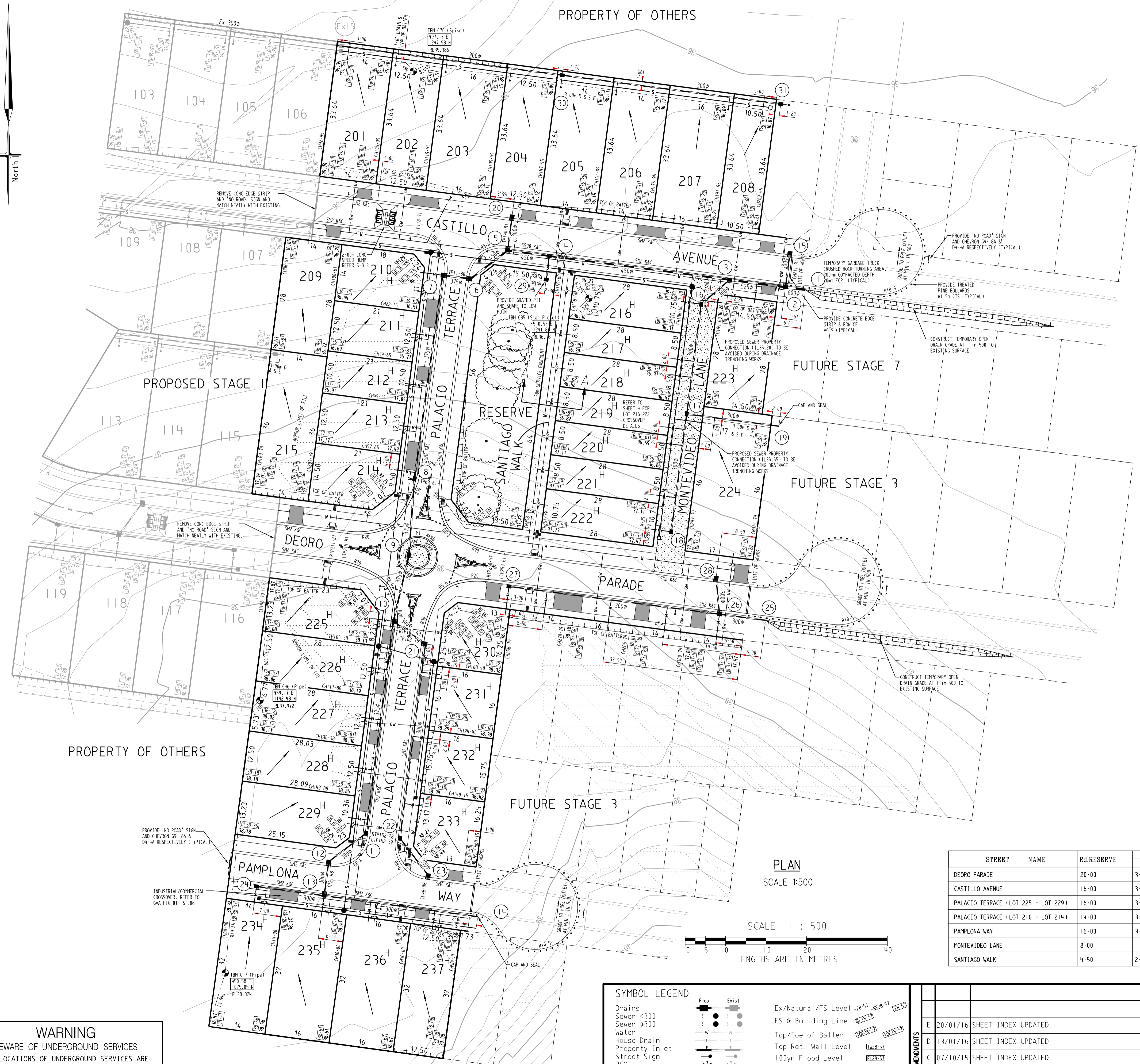
PLAN SCALE 1:500