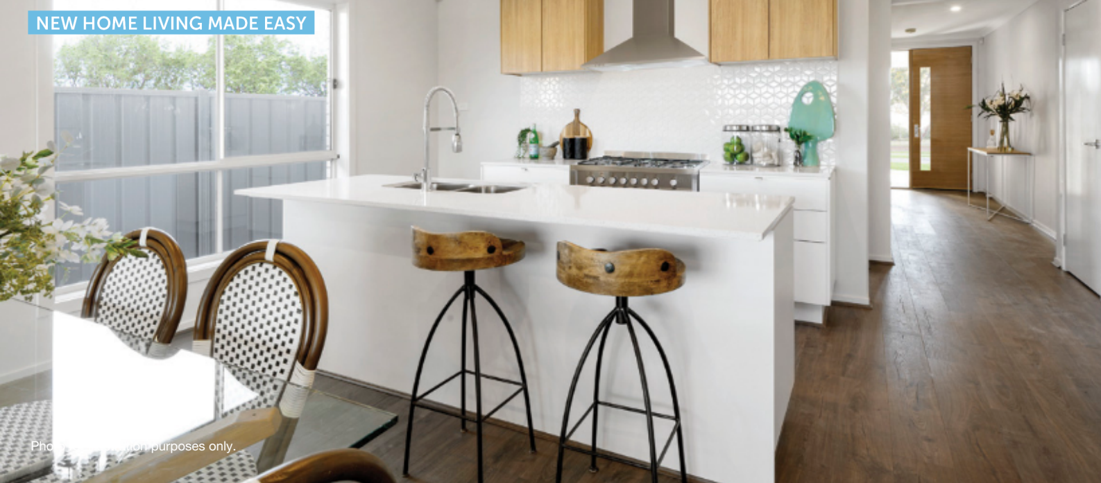
Photo for illustration purposes only.