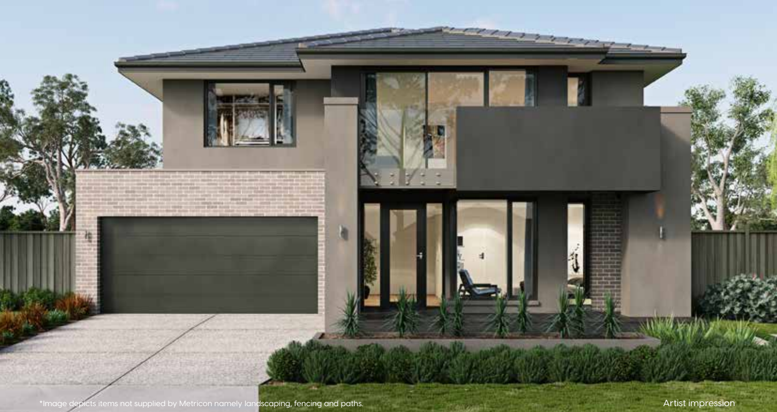
*Image depicts items not supplied by Metricon namely landscaping, fencing and paths.