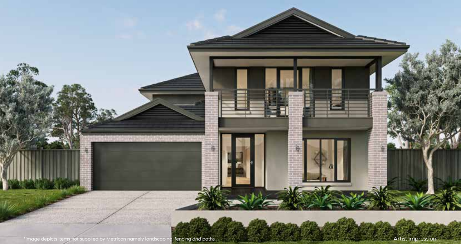
*Image depicts items not supplied by Metricon namely landscaping, fencing and paths.