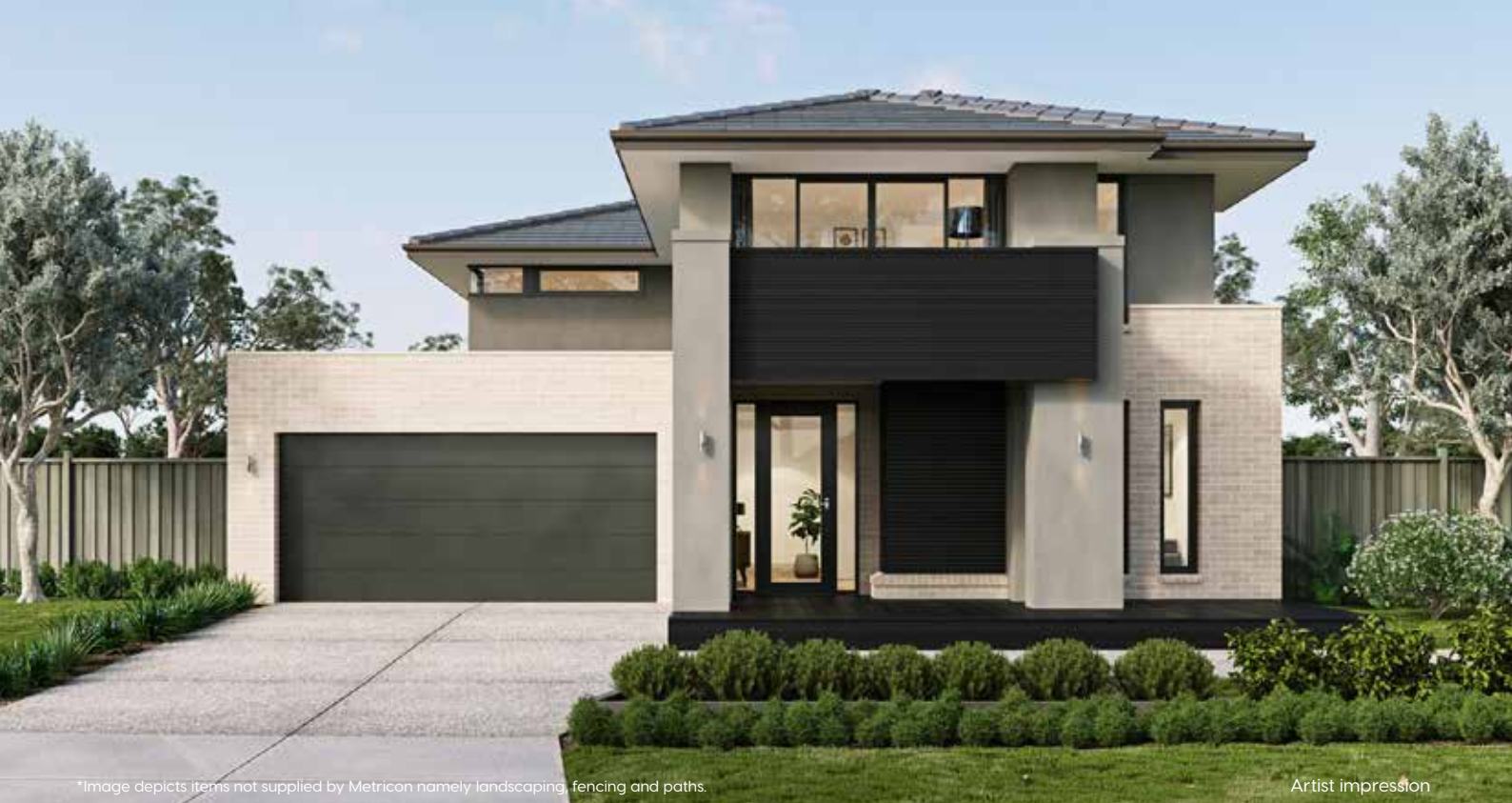
*Image depicts items not supplied by Metricon namely landscaping, fencing and paths.