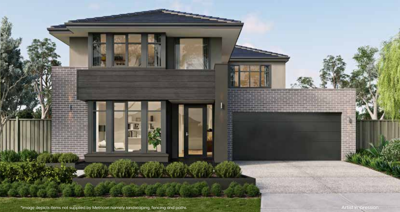
*Image depicts items not supplied by Metricon namely landscaping, fencing and paths.